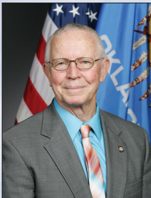
2300 N. Lincoln Blvd., Rm 546 Oklahoma City, OK 405-557-7375